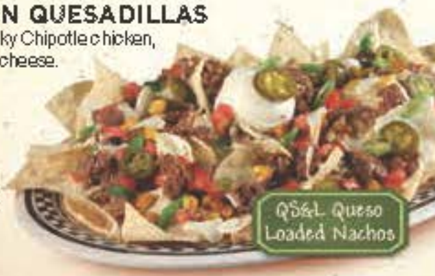
QS&L Queso Loaded Nachos

Fresh warm tortilla chips topped with creamy white cheese QUESO, seasoned beef, fire-roasted corn & black beans, Pico de Gallo, jalapeño and sour cream