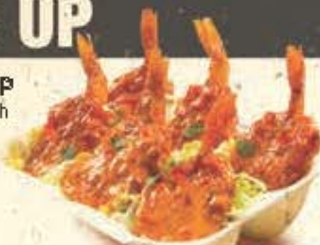
Boom Boom Shrimp

STICK SHIFTERS Wisconsin mozzarella coated with zesty garlic crumbs, fried golden with fresh Parmesan and marinara aside Shareable