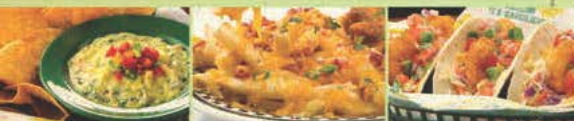
SPIN-OUT ARTICHOKE DIP