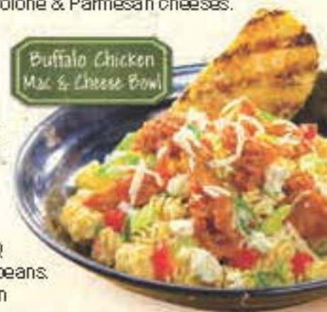
Buffalo Chicken Mac & Cheese Bowl

SESAME CHICKEN RICE BOWL Sautéed tender chicken crusted with sesame seeds and coated with fiery Thaiian sauce served over Lube rice, steamed fresh broccoli and carrots